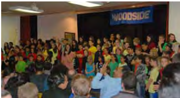
4th & 5th Grade Concert – “Drumming Up World Music”