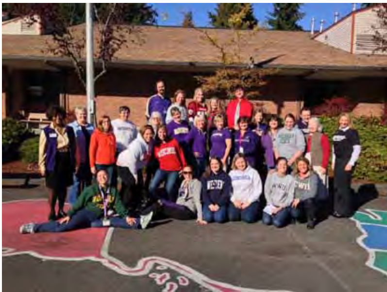
“College Knowledge” Day! Woodside staff wore college attire and shared with students what college has meant for their lives and careers.