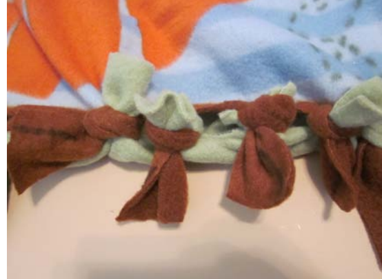
↑ Knots are too short and too wide (hard to knot & bulky)