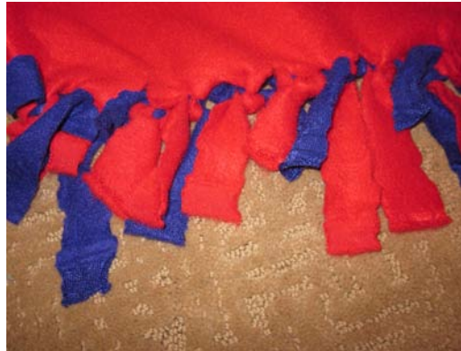
Very ragged edges from a dull scissors.