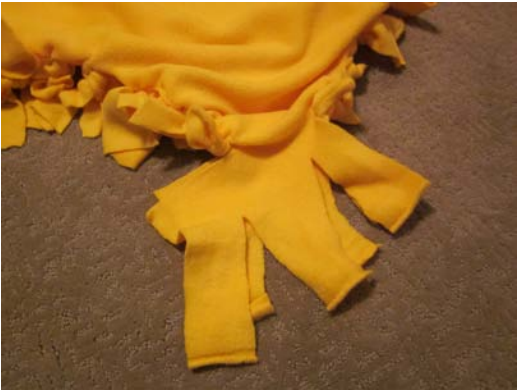
Improperly cut corners