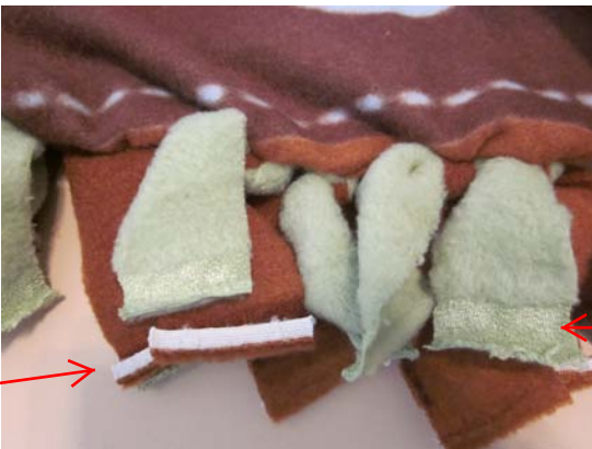
↑ Did we say "Cut off the selvage FIRST." Often, the fringe becomes too short if you cut it off after you tie knots.