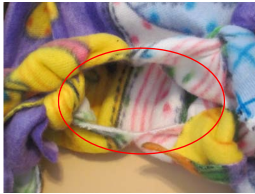
Same blanket, another corner.