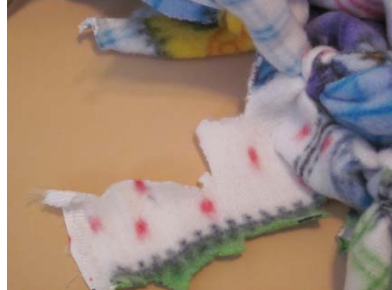
↑ Fringe cut with dull or paper scissors.