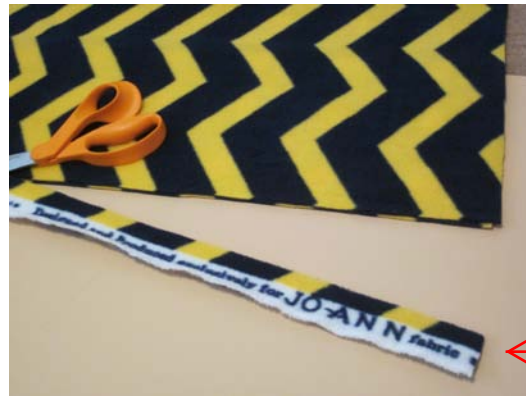
↑ Rule #2 Cut off the Selvage Ends before cutting fringe.