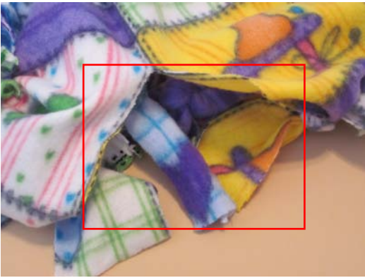
Corners cut improperly, leaving holes in corners