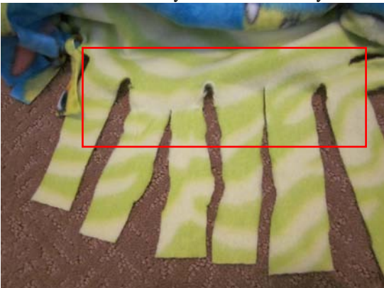
↑ Uneven fringe lengths.