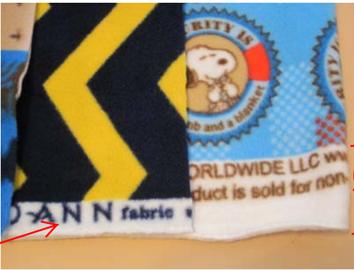
↑ #1 Rule: Cut off the 2 Selvage Ends FIRST!