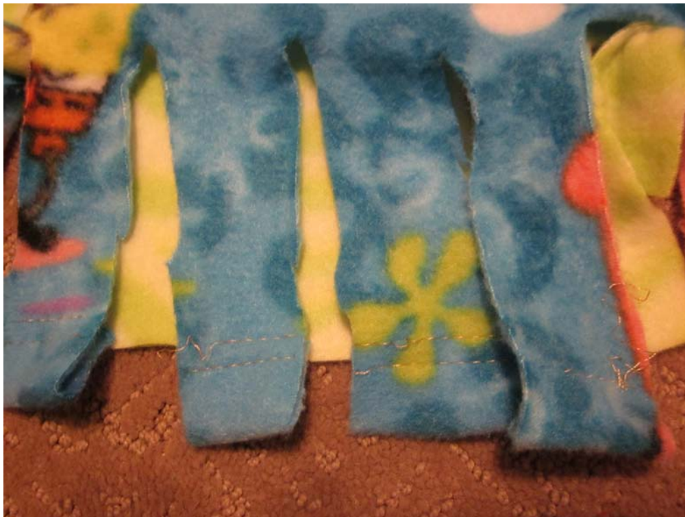
This was either the stitching at the end of the bolt or a store-bought blanket. This edge should have been cut off first (like selvage). We don't accept store-bought blankets.