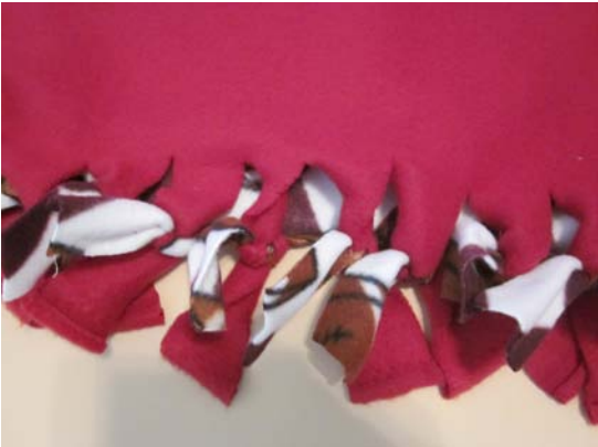
↑ Knots are too loose, making holes in blanket.