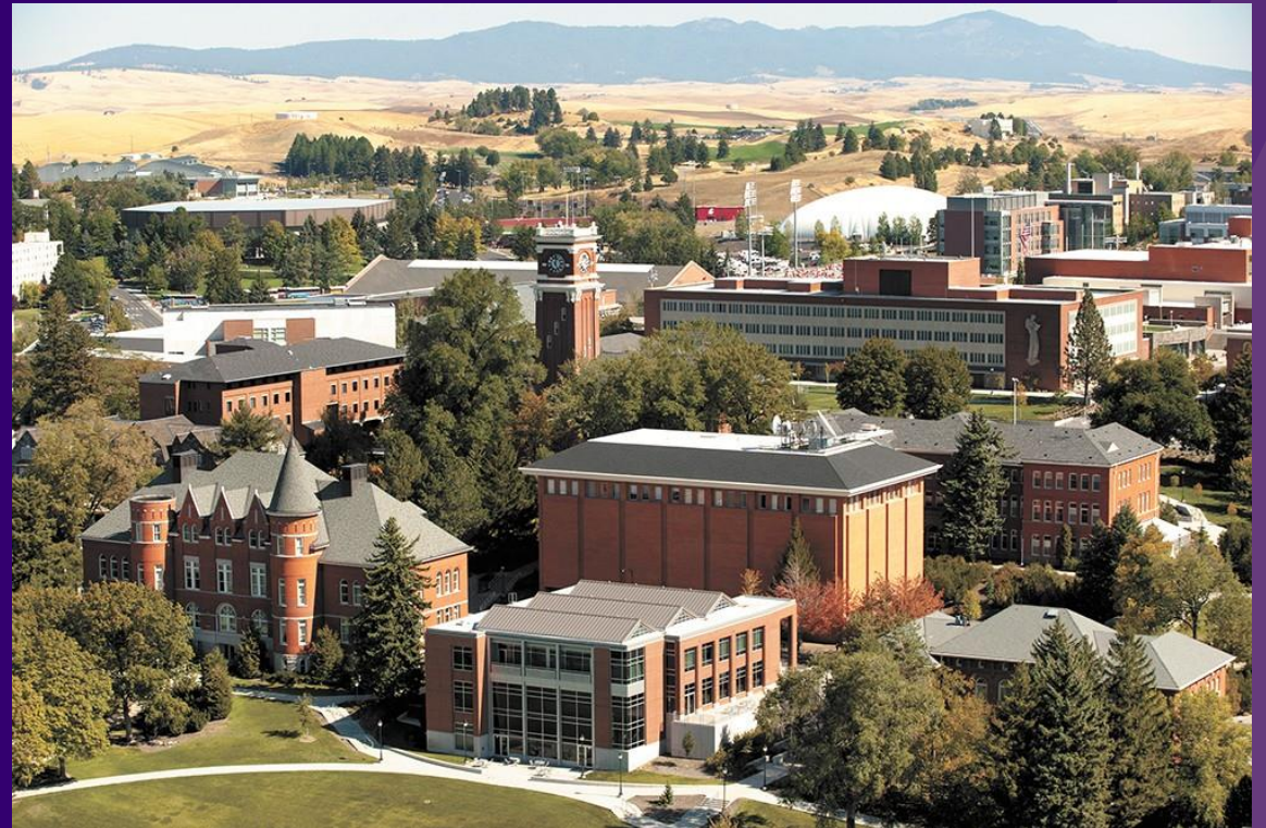
Washington State University