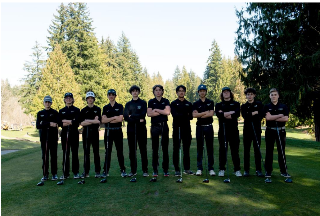
Boys Golf 2023