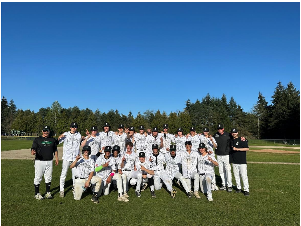
Congratulations to our WESCO 4A Champion baseball team!