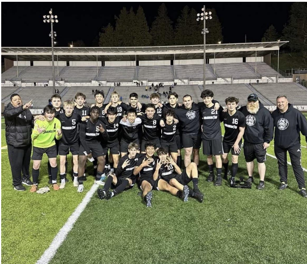
Boys Soccer: WESCO 4A Champions! Congratulations!