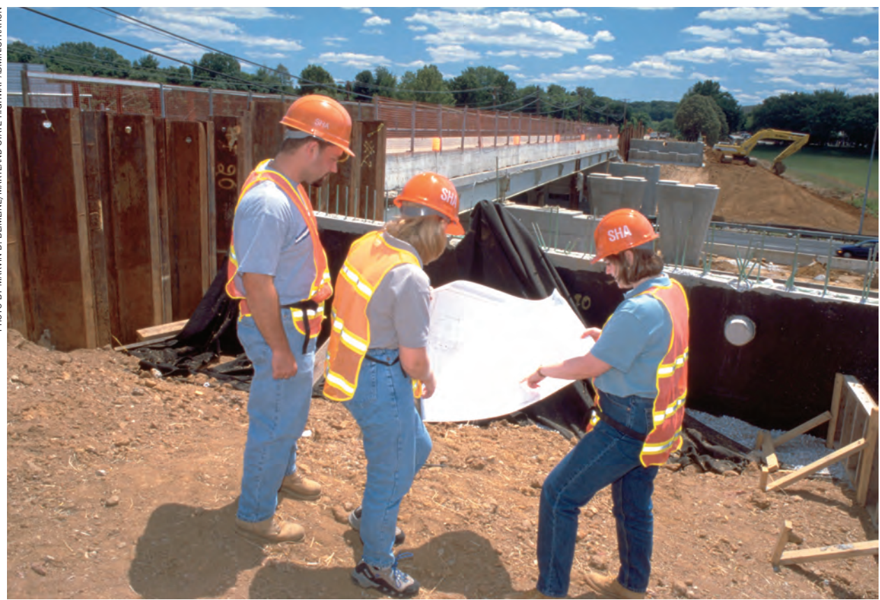
Using computer technology to redesign bridges

to show how a new bridge will look in a certain area. That comes in handy when the bridge design team is working with local residents who are concerned that the bridge will destroy the appearance of their neighborhood.