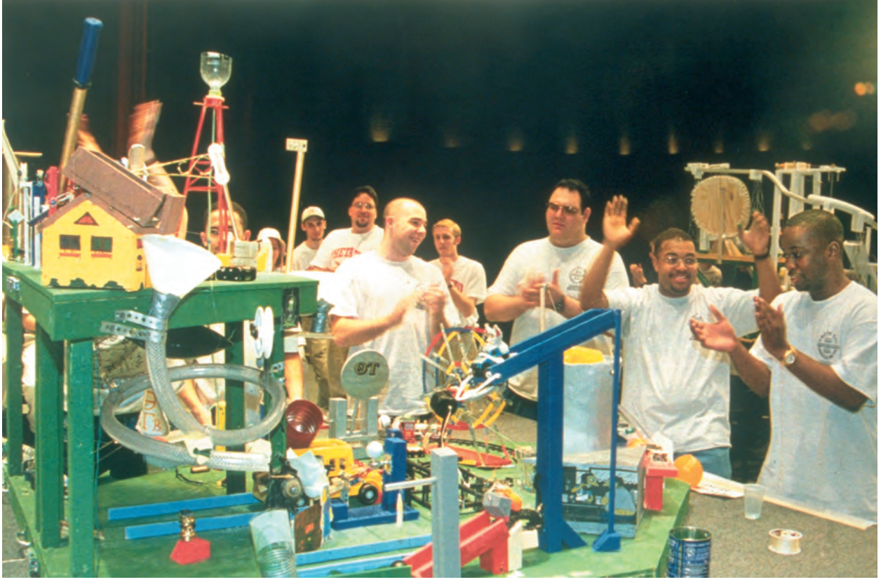
The 1999 Rube Goldberg Machine Contest winners with their Rube Goldberg devices