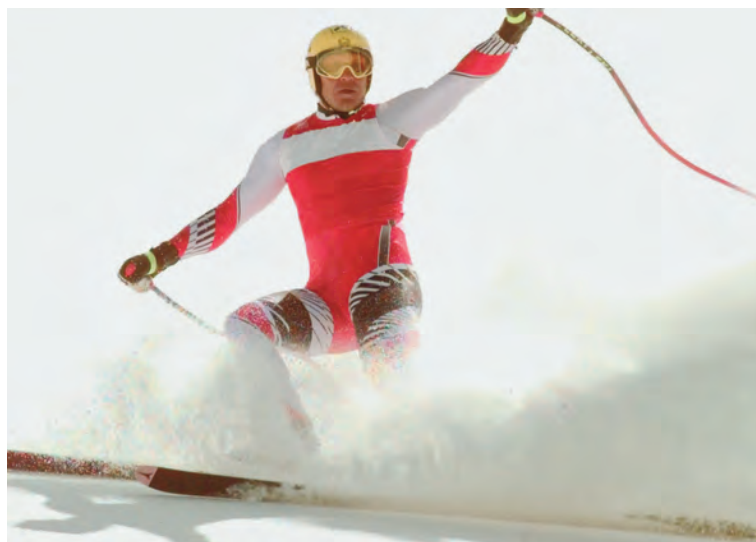
Skillful use of opposing forces lets you come to a safe stop.

What happens when you ski uphill? Gravity works against your upward motion, and you slow down. If the hill is higher than the one you started on, you won't make it to the top. If the second hill is lower than the one you started on, however, you have enough energy to go up and over the top and start down again.